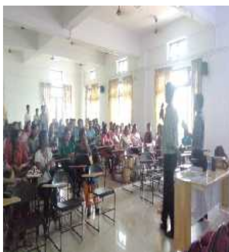
"Build Your Bridge in Just Two Days"

Best Outgoing Student 2012-2016 B.Tech Batch