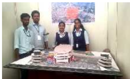
Best Civil Project