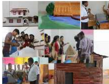
Event photos of Eternia 2015