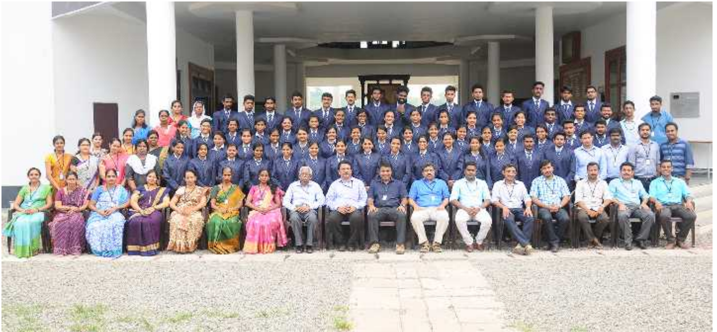
PASSING OUT BTECH BATCH(2012 ADMISSIONS)