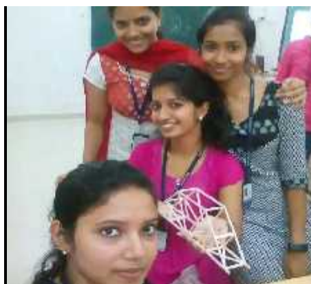
Teams selected for Finals