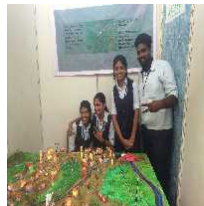
Best Civil Project