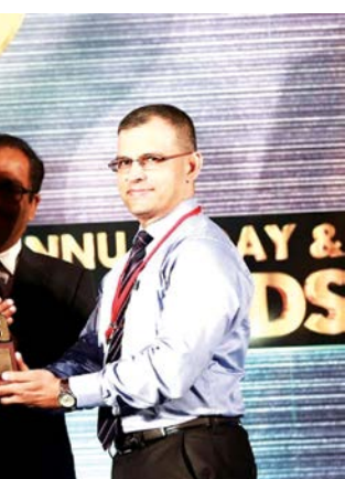
tgits is selected as the best Management Association.