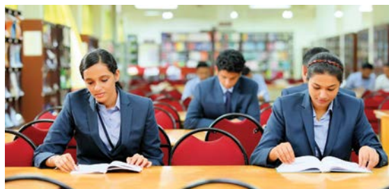
Well stocked library