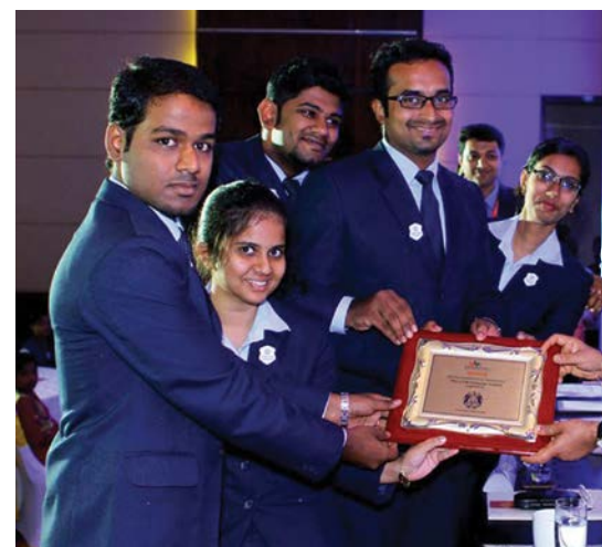
Saintgits team with the winners trophy of The Kerala Startup Mission Cochin Chamber of Commerce and Industry