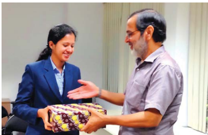
Scholar: Shri. Kochouseph Chittilappilly Founder, V-Guard Industries Ltd

Industrial visit plays an important role in the career of a student who pursues a professional degree. The objective of industrial visit is to provide students an insight on how a company works and to interact with industries. With an aim to go beyond academics, industrial visit provides student a practical perspective on the world of work.