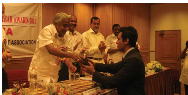
Southern Regional Winners of National Essay and Presentation Competition conducted by All India Management Association