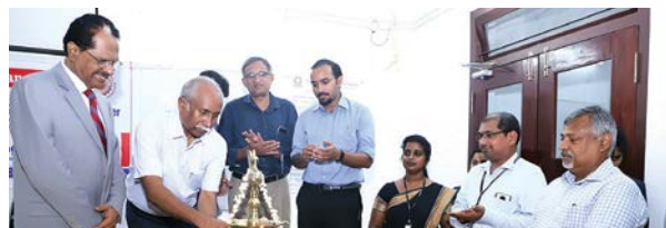
NIPM - Saintgits Chapter Inauguration

The management fest of the students of Saintgits Institute of Management is the forum for management students from different parts of the state of Kerala and outside to come together, share, compete and learn. These meets are the places where networking happens and students get exposed to another environment. Simthesis 2019 provided opportunity for more than 600 students to meet and interact. The events, mostly based on functional areas of management were designed specially to test knowledge and aptitude in the respective area. The institution and students see these events as an opportunity to learn, practice what is learnt in the class room and broaden their thinking. The theme of Simthesis has been: Imagine, Innovate and Implement.