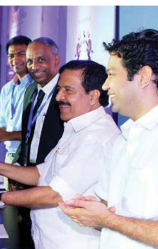
Business Plan Contest by the