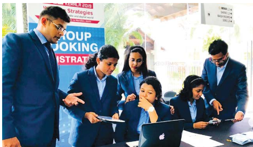
Students at TiECON