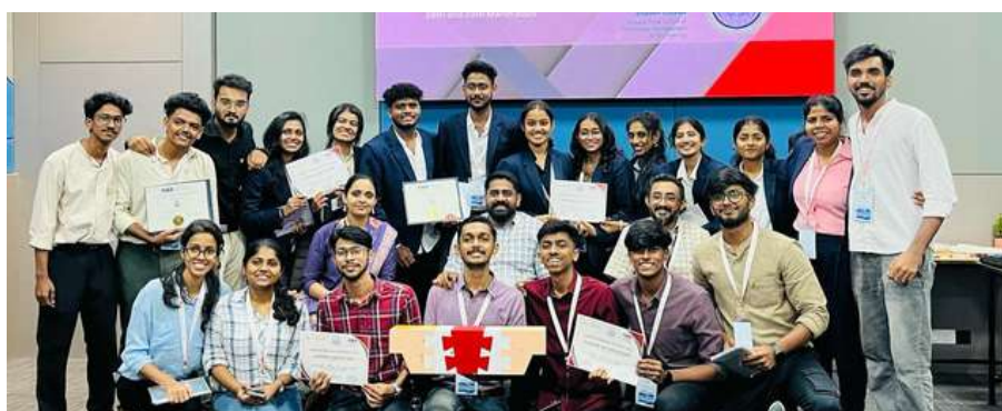
7 Out of 8 – Team ASCE Saintgits Dominating the ASCE India Region Symposium at Mumbai