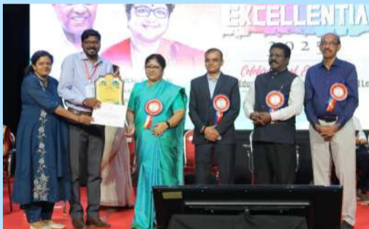
Award distribution ceremony