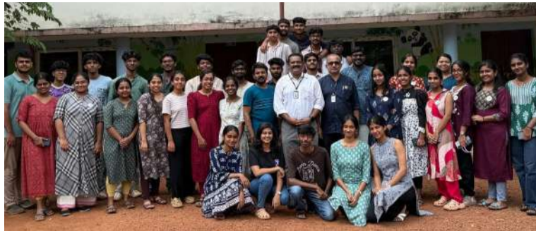
NSS Team at Govt. U.P. School, Kurichy