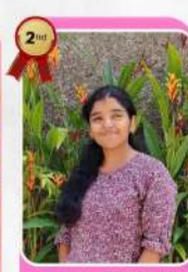
TINA RACHEL SIBI VIBE CODING ₹800 HELD AT SAINTGITS COLLEGE