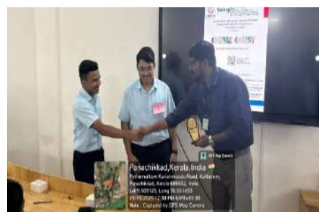
price distribution of culture quest

Kottayam: MAGNUM, the management association of the Department of Business Administration, in association with IQAC, organized “Culture Quest – Global Company Culture Day Quiz” on 19th September 2025 at Multimedia Room. The quiz was designed to promote