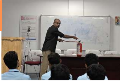
Demonstration of fire safety