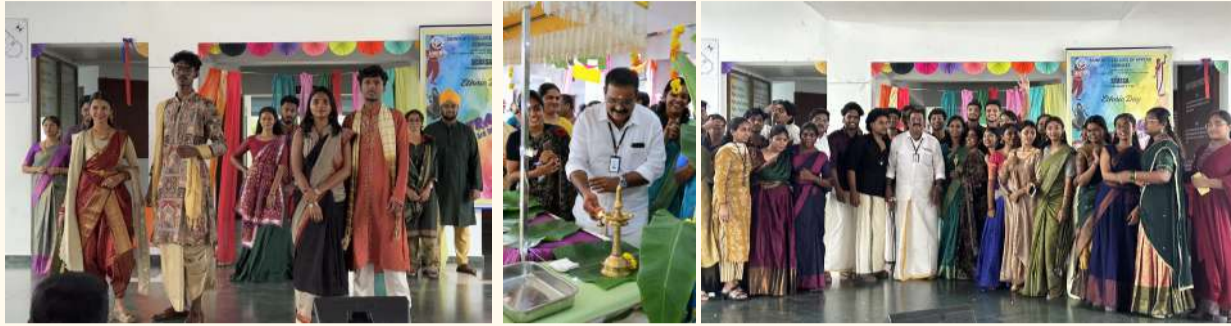
SCASSA Ethnic Day - SATRANG