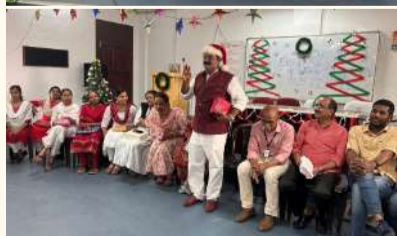
Christmas vibes at EKTHA