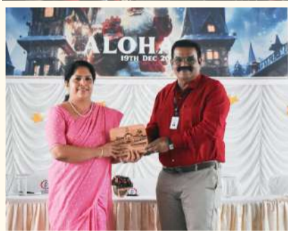
Highlights from ALOHA