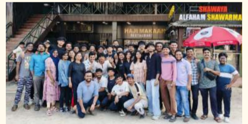
BCom S6 A Batch Study Tour