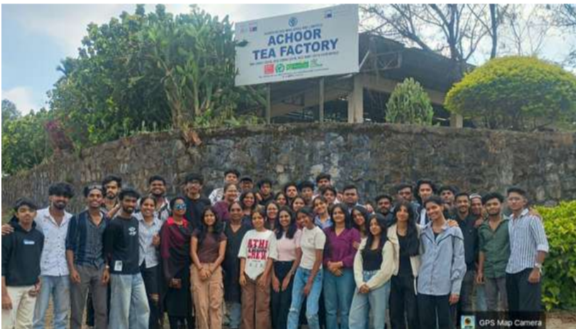
BBA industrial visit, at Harrison Malayalam Tea Estate.