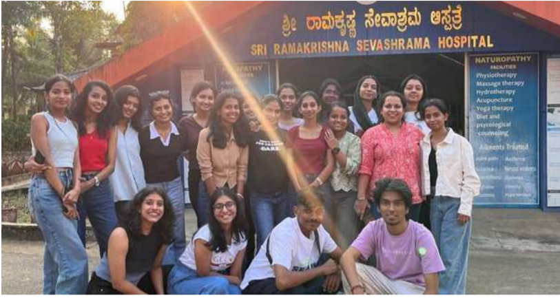
Industrial Visit conducted as part of the Study Tour Programme by the Department of Psychology.